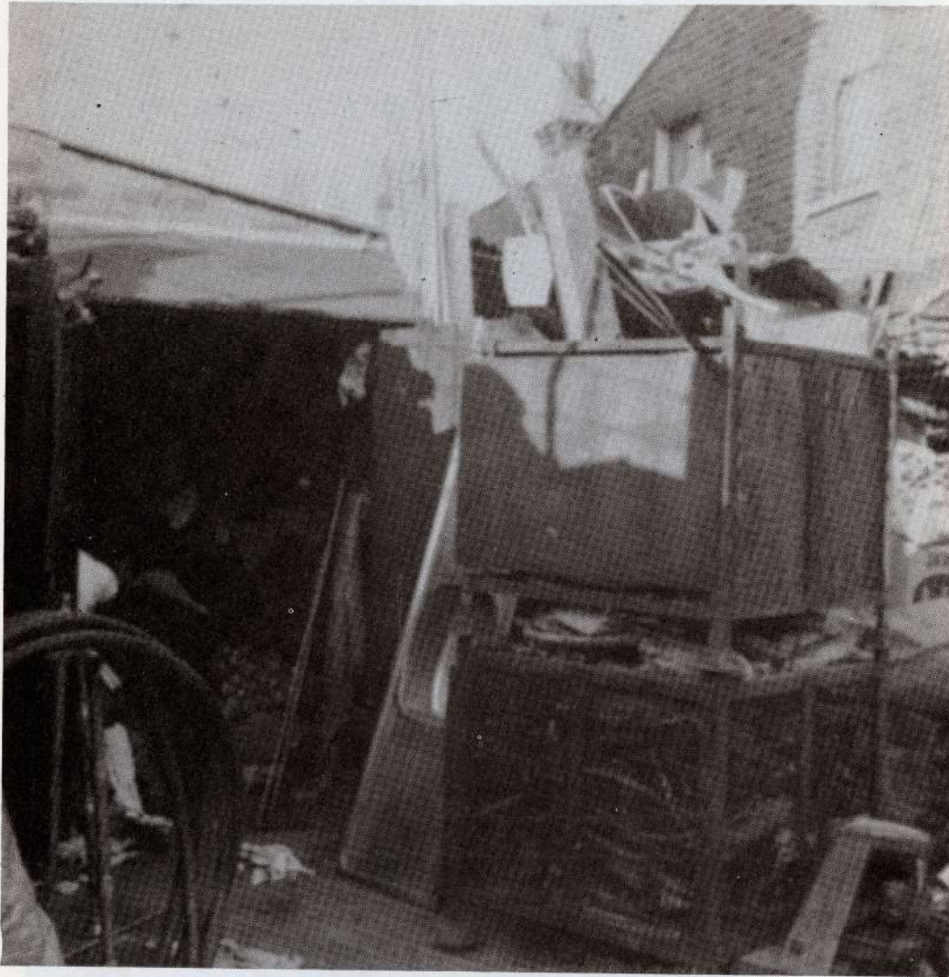
Scrap metal yard. They buy the metal and sort it.